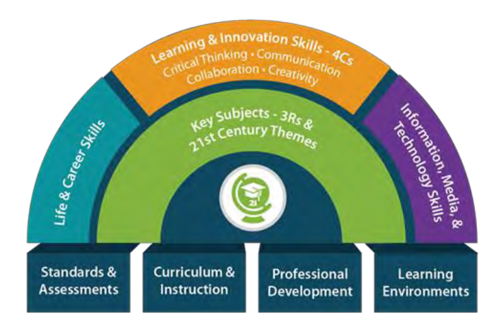
Fig. 2 The Framework of 21st century skills